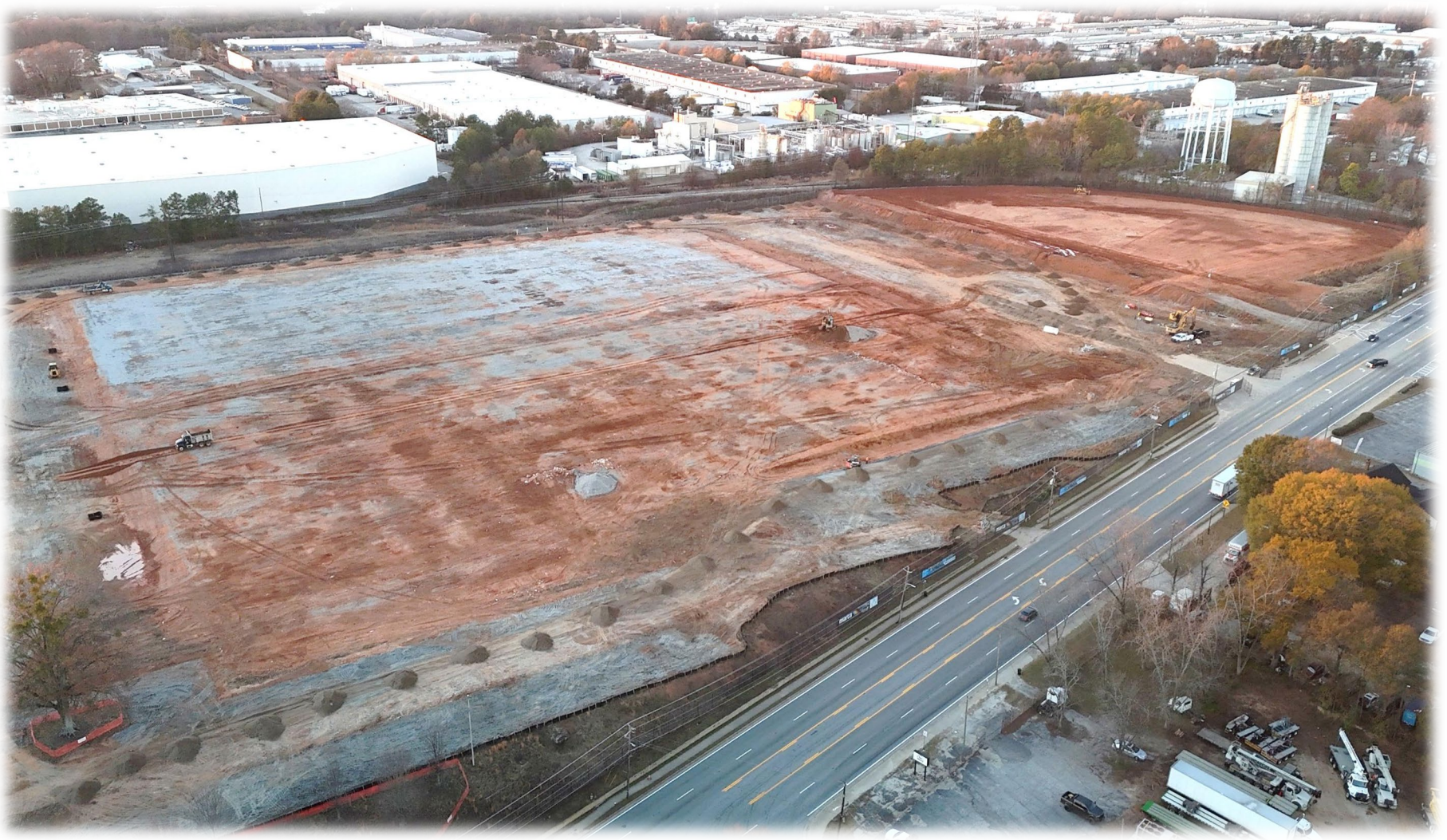
Current Site Condition