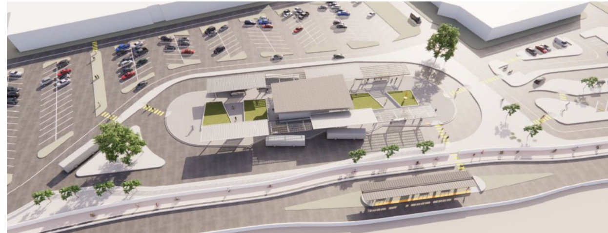
Transit Hub rendering for representation purposes only